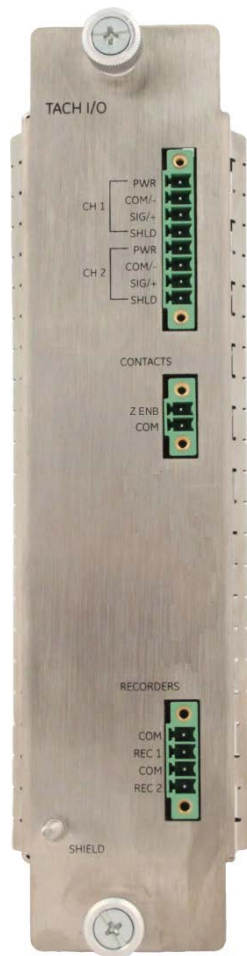
Figure 2: Front view of the Tachometer I/O module