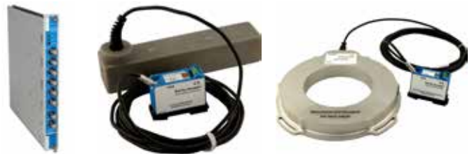
Typical MSIM System components shown above.

In addition to the HSCT, the MSIM monitor uses High Voltage Sensors (HVS) with interface modules, along with motor stator temperature (RTDs or thermocouples) as inputs to the system.