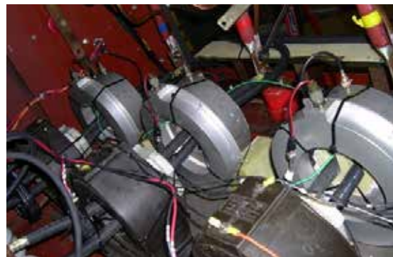
Typical MSIM Installation shown here.